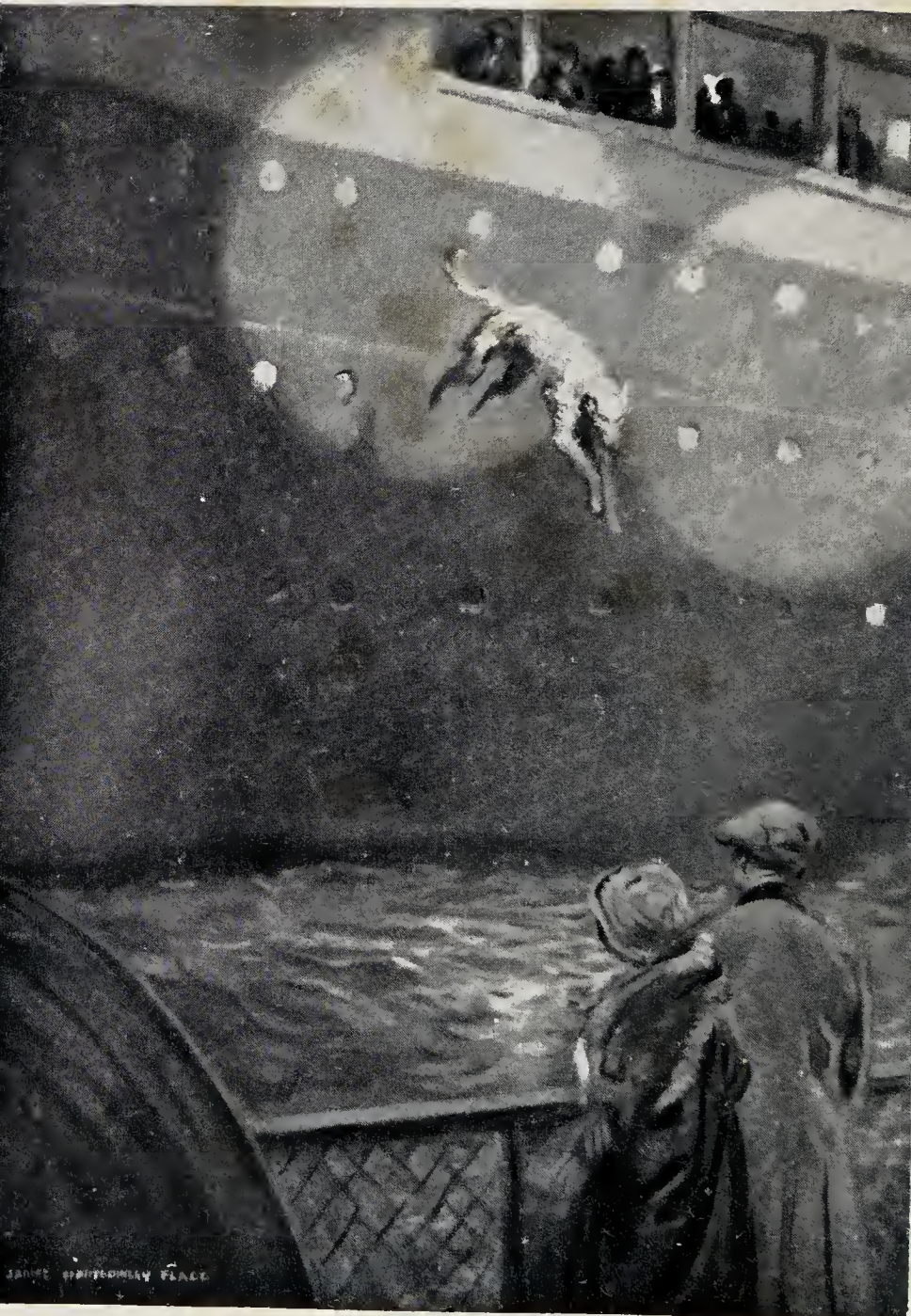
A white streak—like the finger of conscience pointing at Santa.